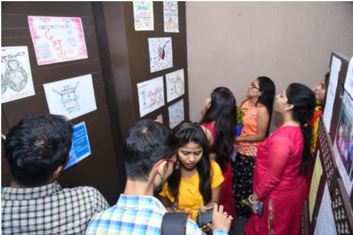
Photo 5.4: Exhibition of Posters of Poster making competition of CIDCO Staff