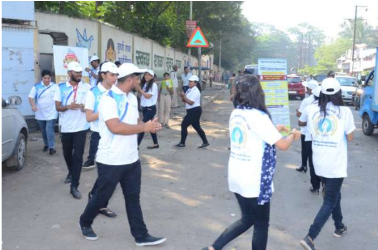
Photo 3.6: Street play performed by College students during Vigilance Awareness week of the year 2018 at Kalamboli