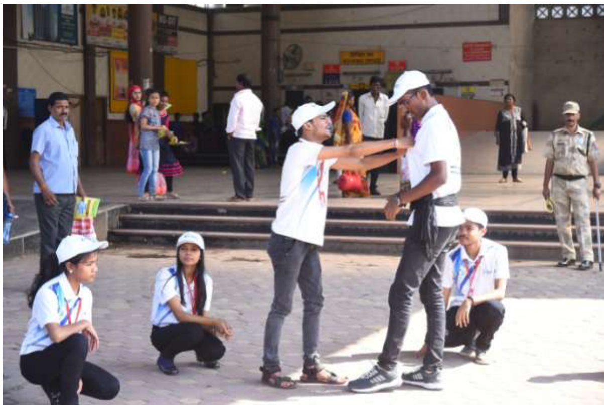
Photo 3.4: Street play performed by College students during Vigilance Awareness week of the year 2018 at Koparkhairane Railway station