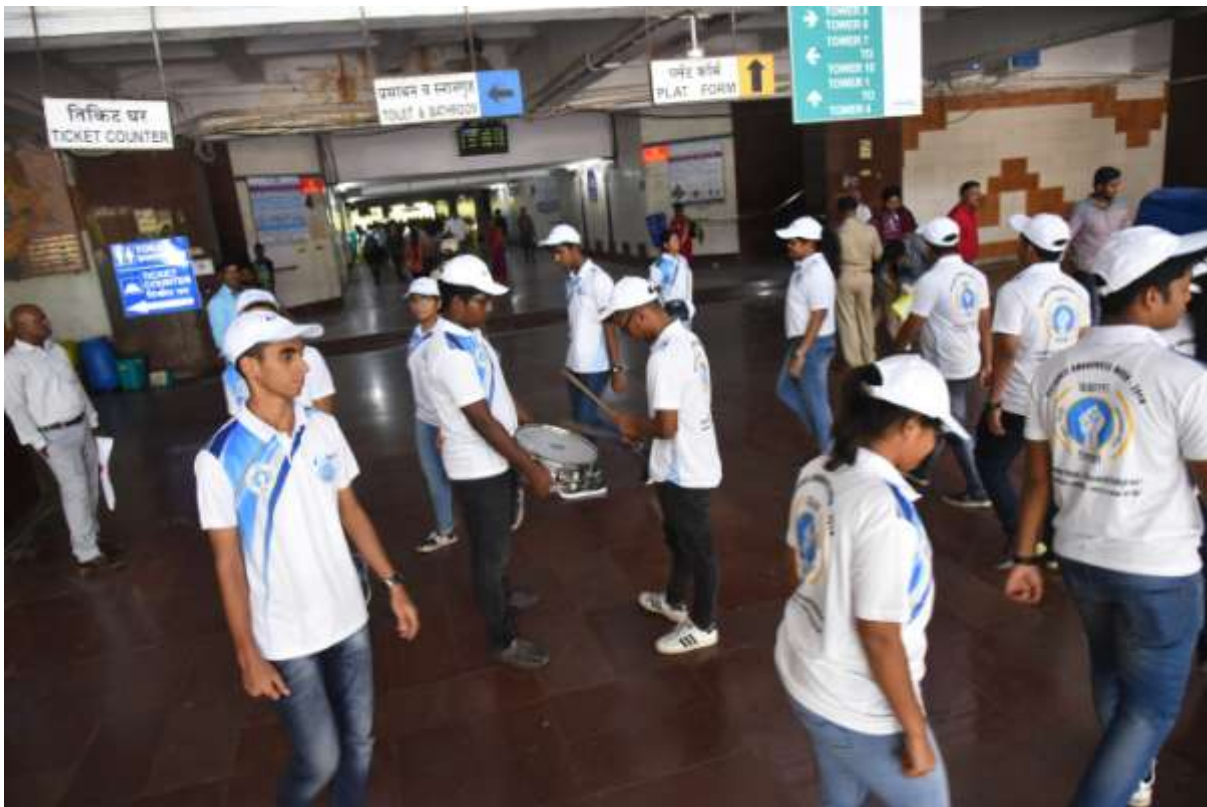
Photo 3.3: Street play performed by College students during Vigilance Awareness week of the year 2018 at Railway Station, CBD-Belapur