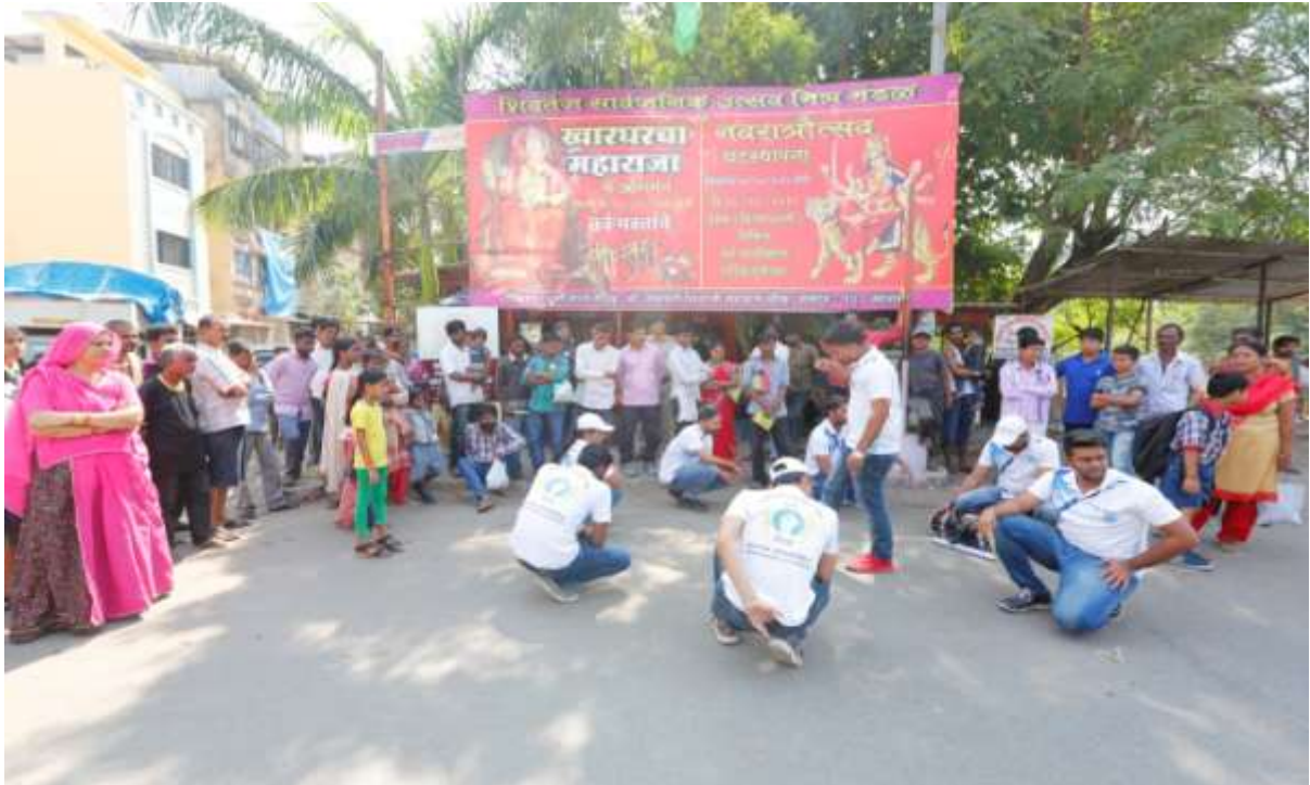
Photo 3.2: Street play performed by College students during Vigilance Awareness week of the year 2018 at Kharghar