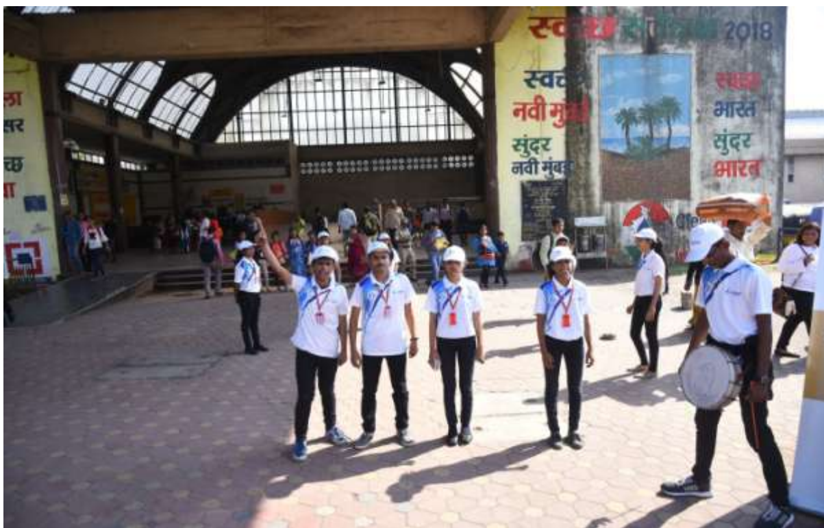
Photo 3.5: Street play performed by College students during Vigilance Awareness week of the year 2018 at Koparkhairane