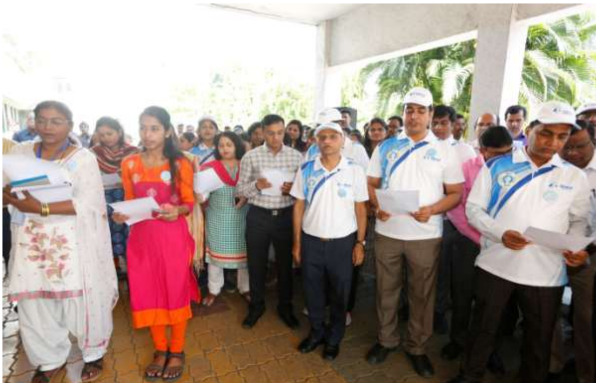
Photo 1.4 : Oath taken by CIDCO officers/ employees during Vigilance Awareness week of the year 2018