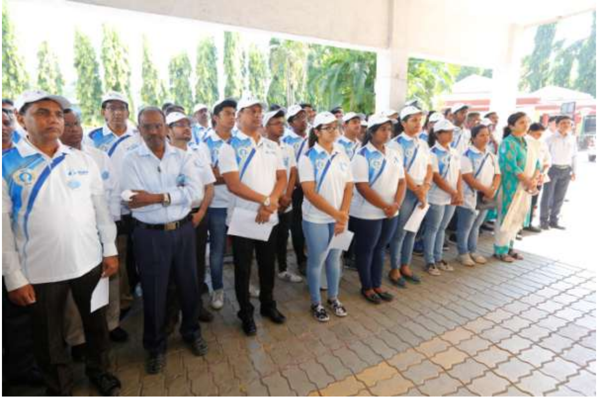
Photo 1.6 : Oath taken by CIDCO officers/ employees & students during Vigilance Awareness week of the year 2018