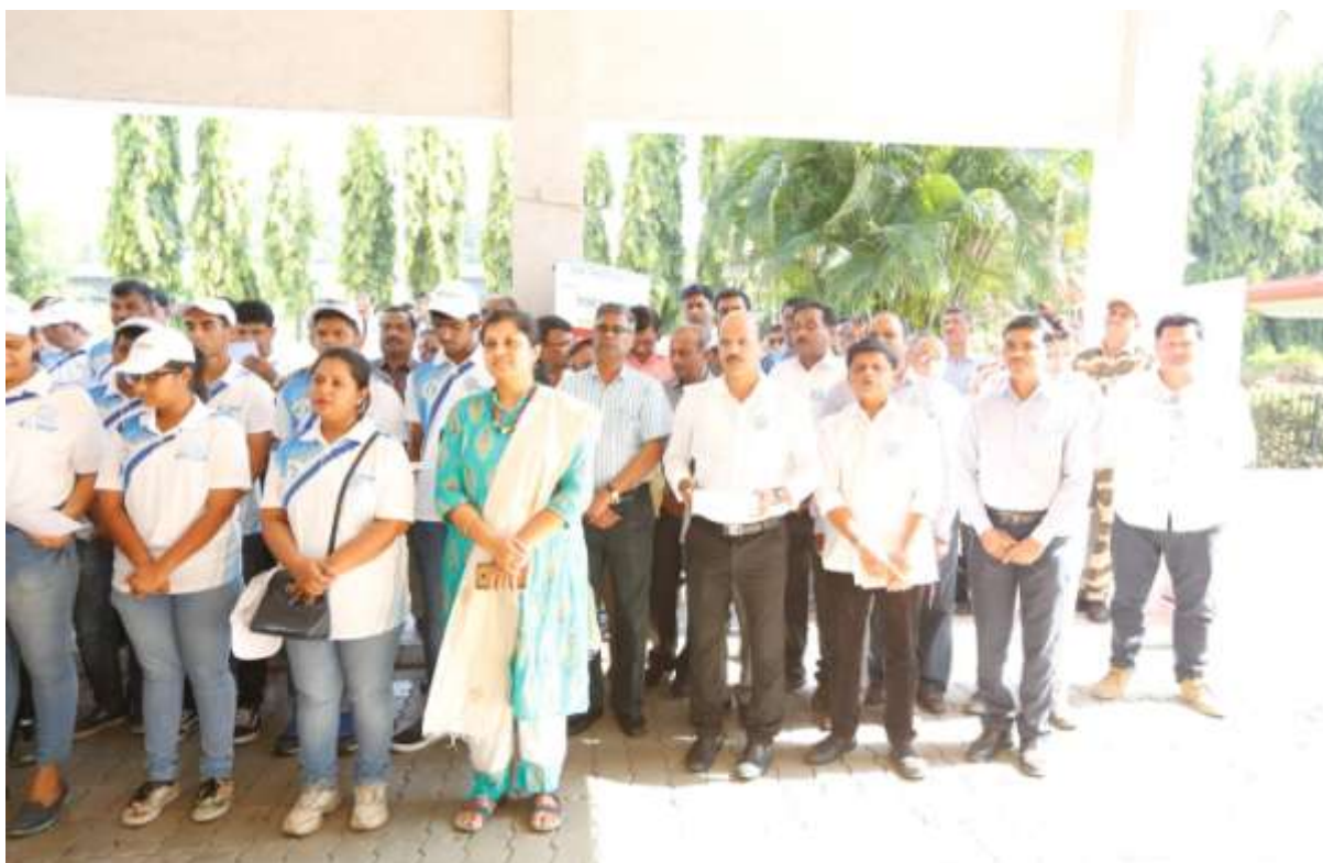
Photo 1.5 : Oath taken by CIDCO officers/ employees & students during Vigilance Awareness week of the year 2018