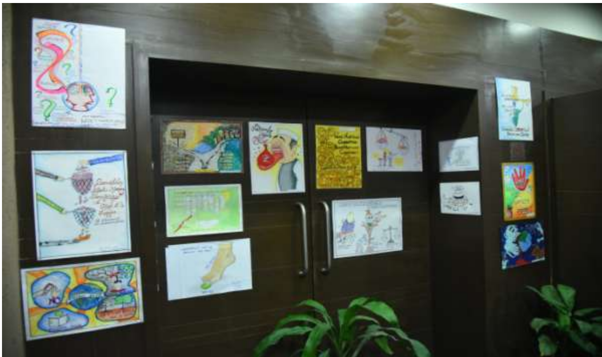
Photo 5.2: Exhibition of Posters of Poster making competition of CIDCO Staff