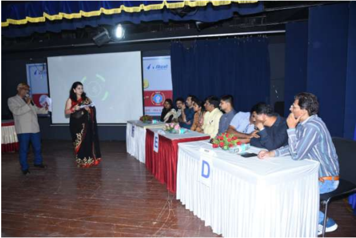
Photo 4.1: Street play performed by College students during Vigilance Awareness week of the year 2018 at Raigad Bhawan, CBD-Belapur