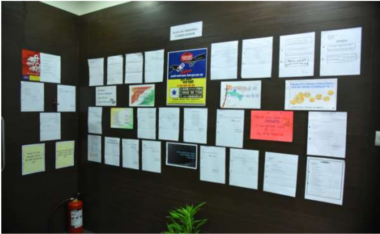
Photo 5.3: Exhibition of Slogans of slogan writing competition of CIDCO Staff