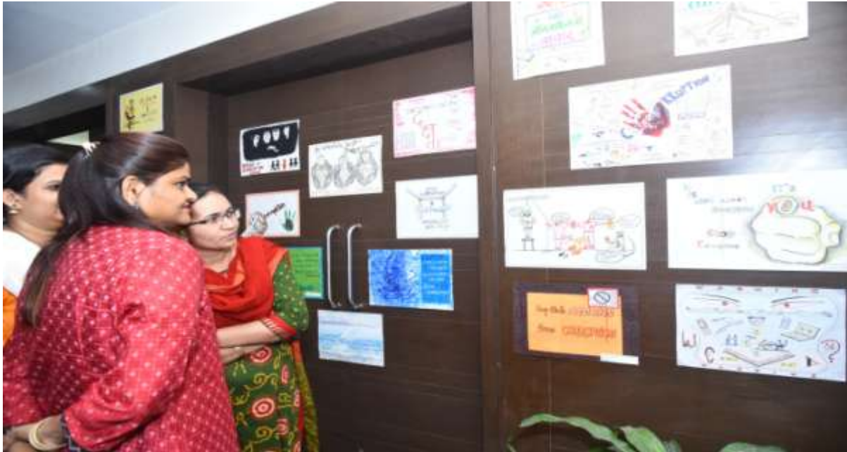
Photo 5.1: Exhibition of Posters of Poster making competition of CIDCO Staff