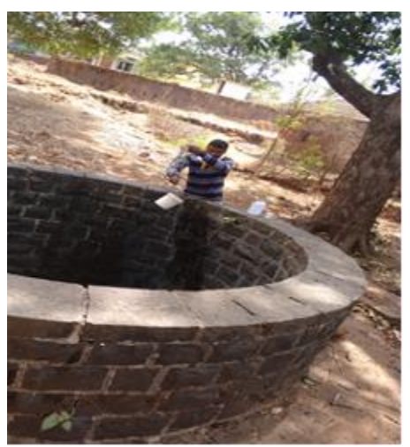
Ground Water Sampling in Progress