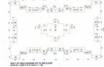
BUILT UP AREA DIAGRAM SET TO 3RD FLOOR